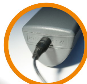
DC 3V Jack

Microprocessor Control with advanced digital signal processing.