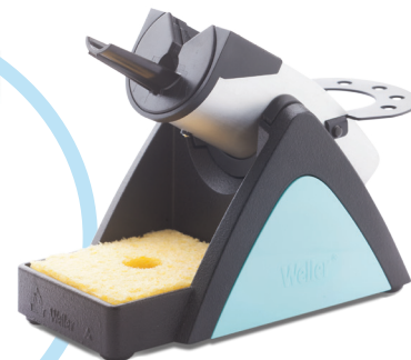
WT1010 Set pictured.

The unique, reversible WSR safety rest flips between sponge and brass wool.