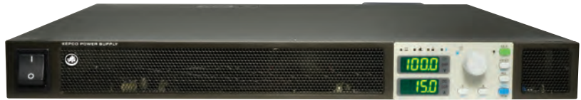
Front View 1U High

If you are looking for a full rack, 1U, 1500 Watt d-c power supply which runs cool in your rack (with no air gap required between units) or on your bench, choose the 1500W Series KLN.