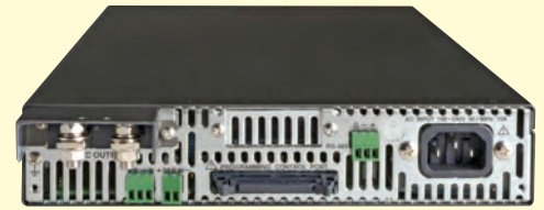
Analog Interface RS 485 Interface (Standard)

(1) C = 1 count of the last displayed digit.