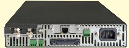
LAN Interface (Optional) Added