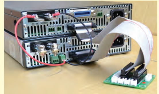
Series connection of two identical KLN power supplies using optional Series Socket Board 536-0130 and Programming Port Cable 518-0119