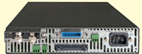
GPIB (IEEE 488) Interface (Optional) Added