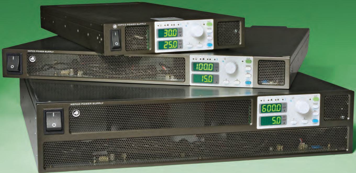
KLN Series Programmable Power Supply: 750W 1U, Half-Rack (top), 1500W 1U, Full Rack (middle), 3000W 2U, Full Rack (bottom)