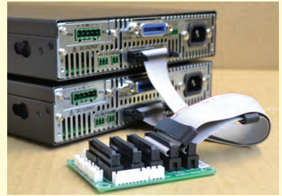
Parallel connection of two identical KLN power supplies (up to five possible) using optional Parallel Socket Board 536-0129 and Programming Port Cable 518-0119